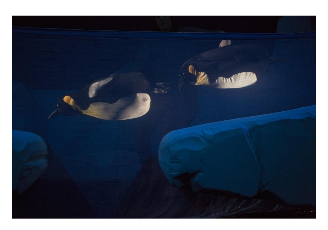
Two older Penguins